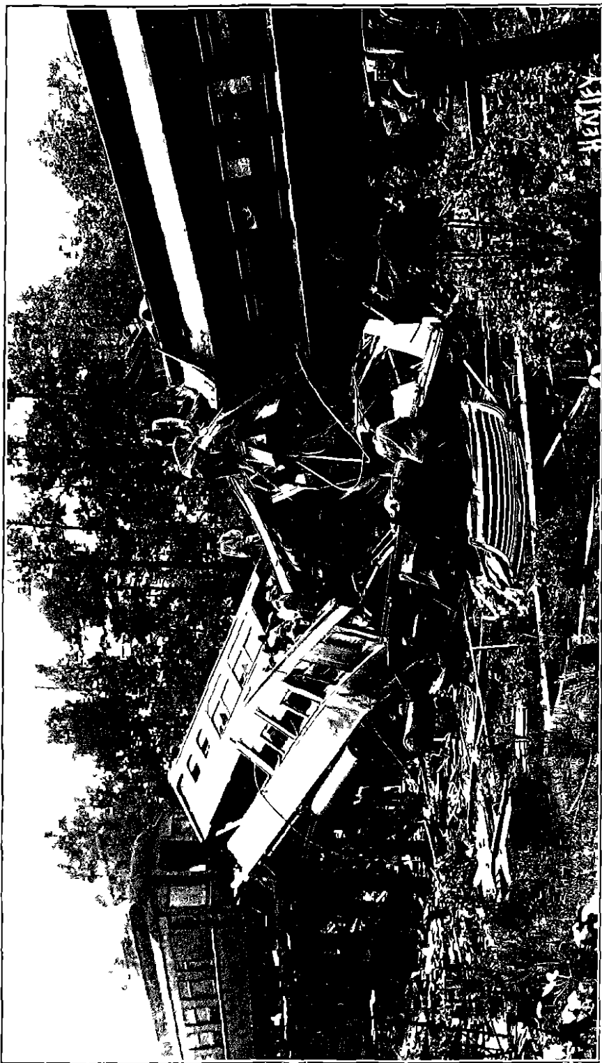
2. VIEW SHOWING FRAGMENTS OF TOURIST SLEEPING CARS NOS. 1102 AND 1161